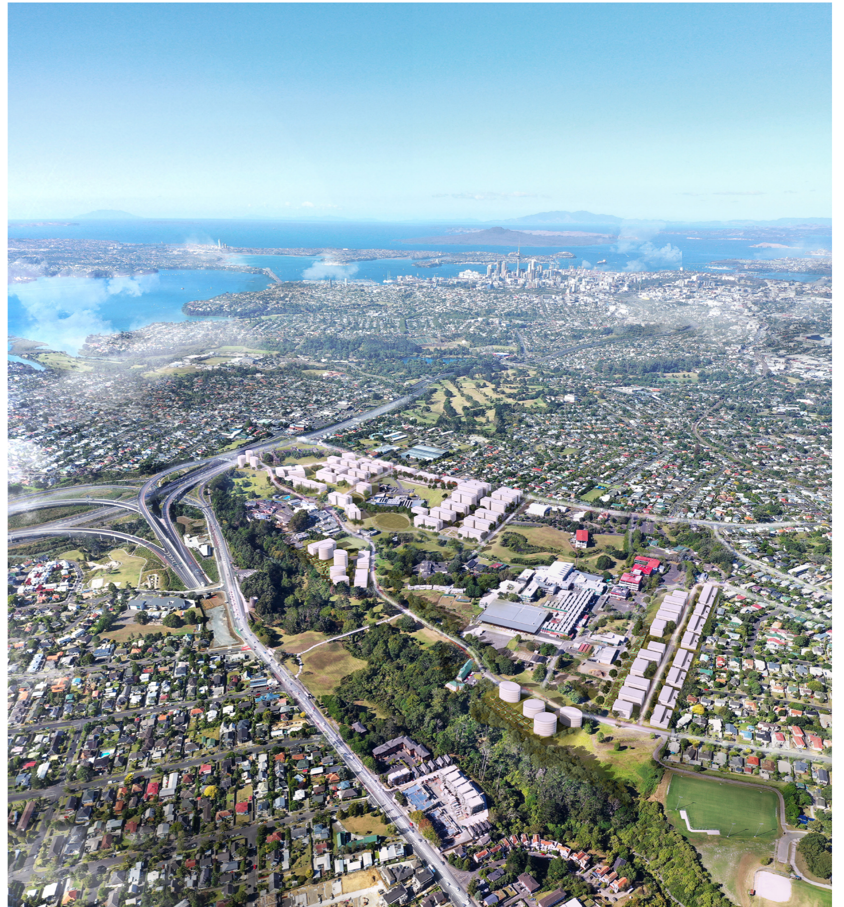
ARTIST'S PERSPECTIVE AERIAL OBLIQUE OF THE SITE