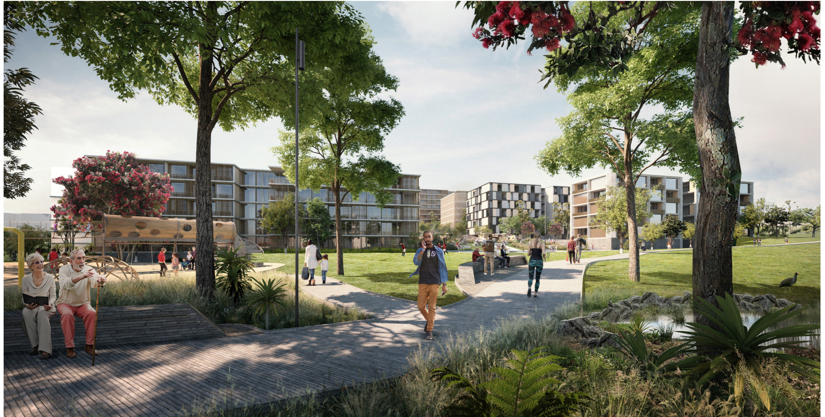
ARTIST'S PERSPECTIVE: WAIRAKA STREAM AND PARKLAND OPEN SPACE LOOKING TOWARD WESTERN SIDE OF CARRINGTON ROAD PRECINCT