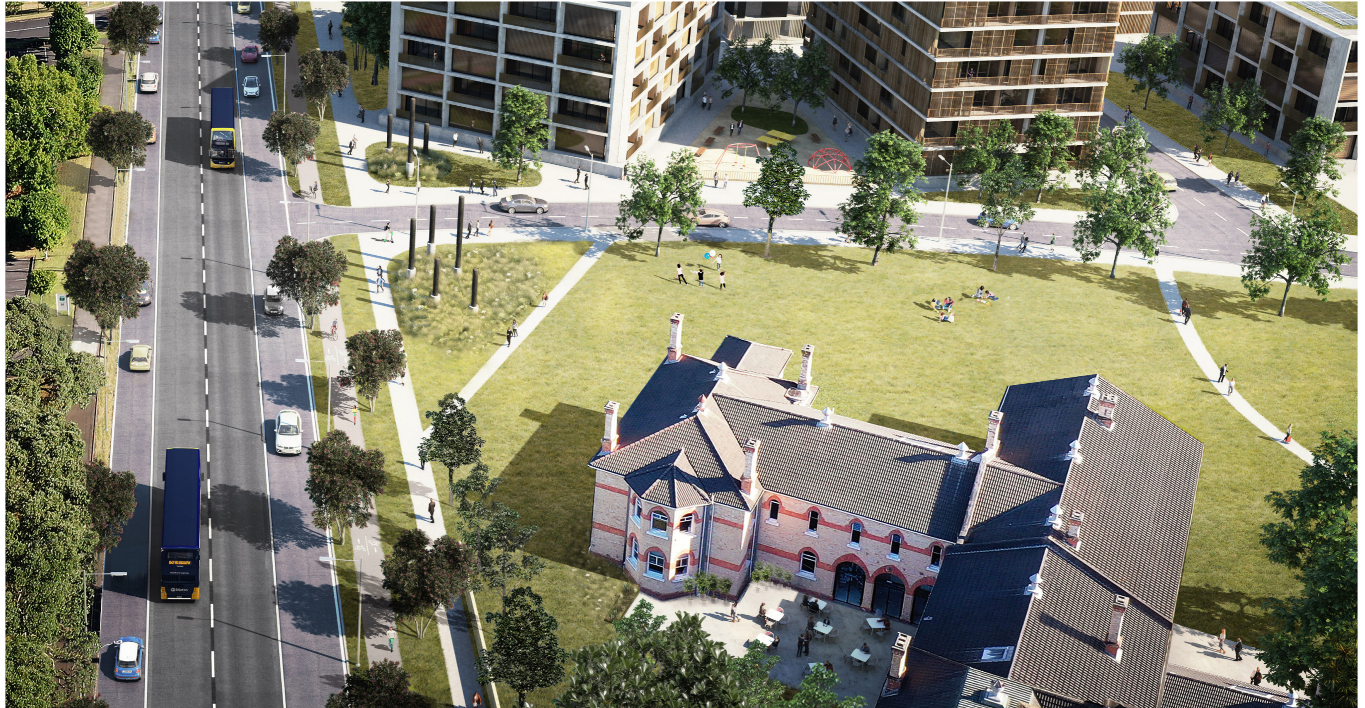
ARTIST'S PERSPECTIVE: AERIAL OBLIQUE LOOKING ALONG CARRINGTON ROAD TO THE NORTHERN PRECINCT, CARRINGTON HOSPITAL PARKLAND AND ADAPTIVE RE-USE