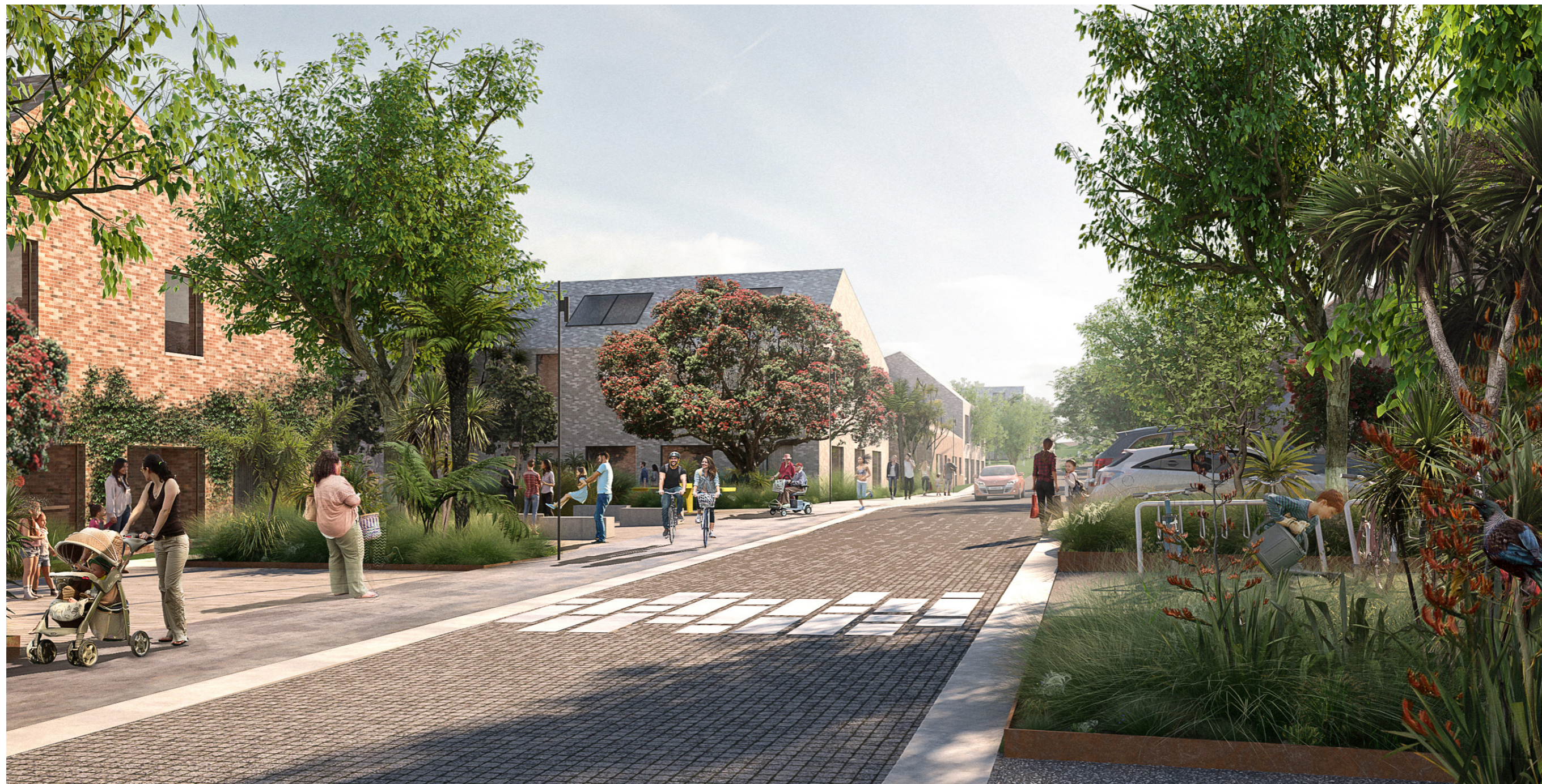
ARTIST'S PERSPECTIVE: SOUTHERN PRECINCT LOOKING EAST ALONG THE CENTRAL STREET