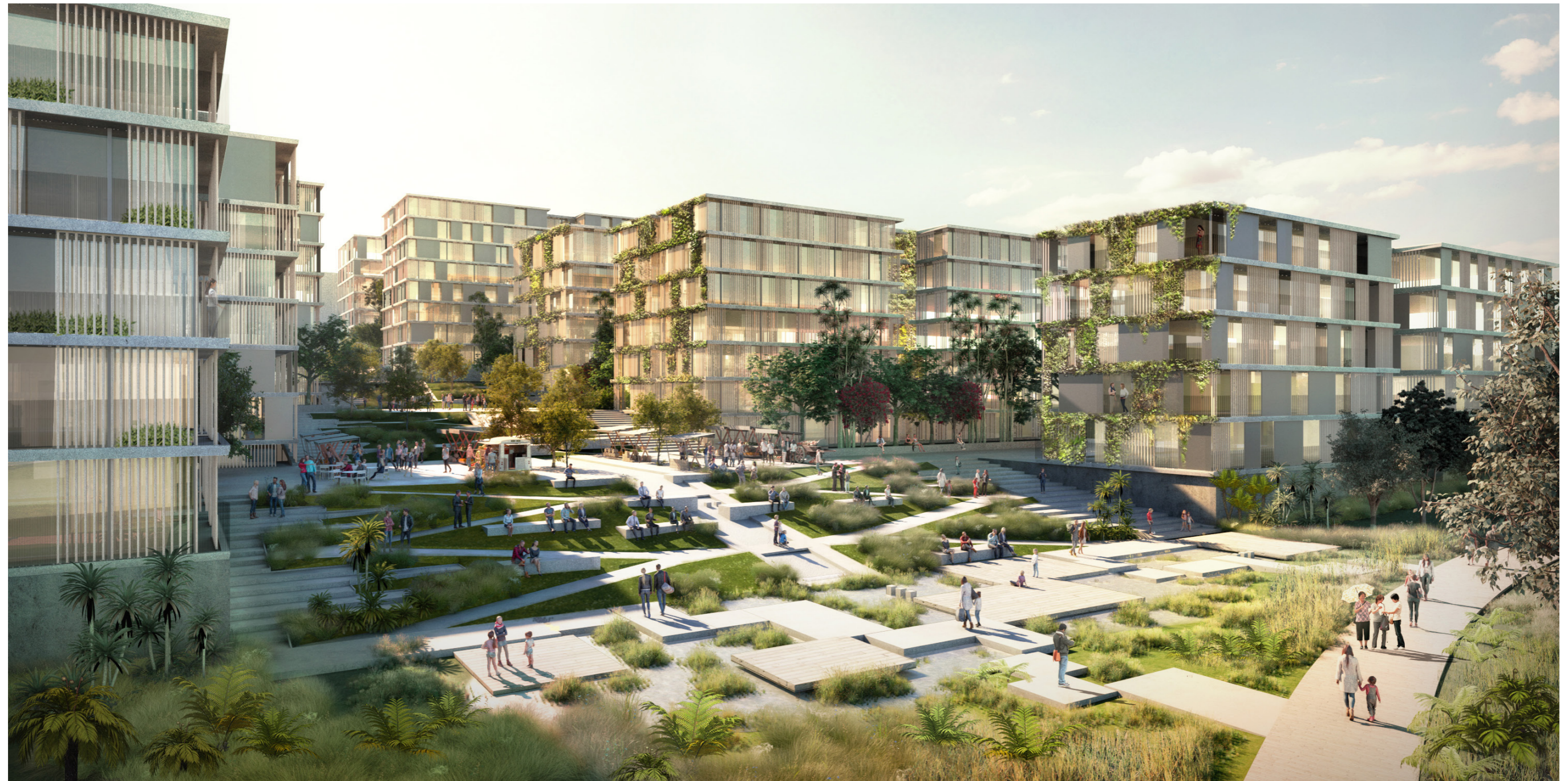
ARTIST'S PERSPECTIVE: CARRINGTON ROAD PRECINCT