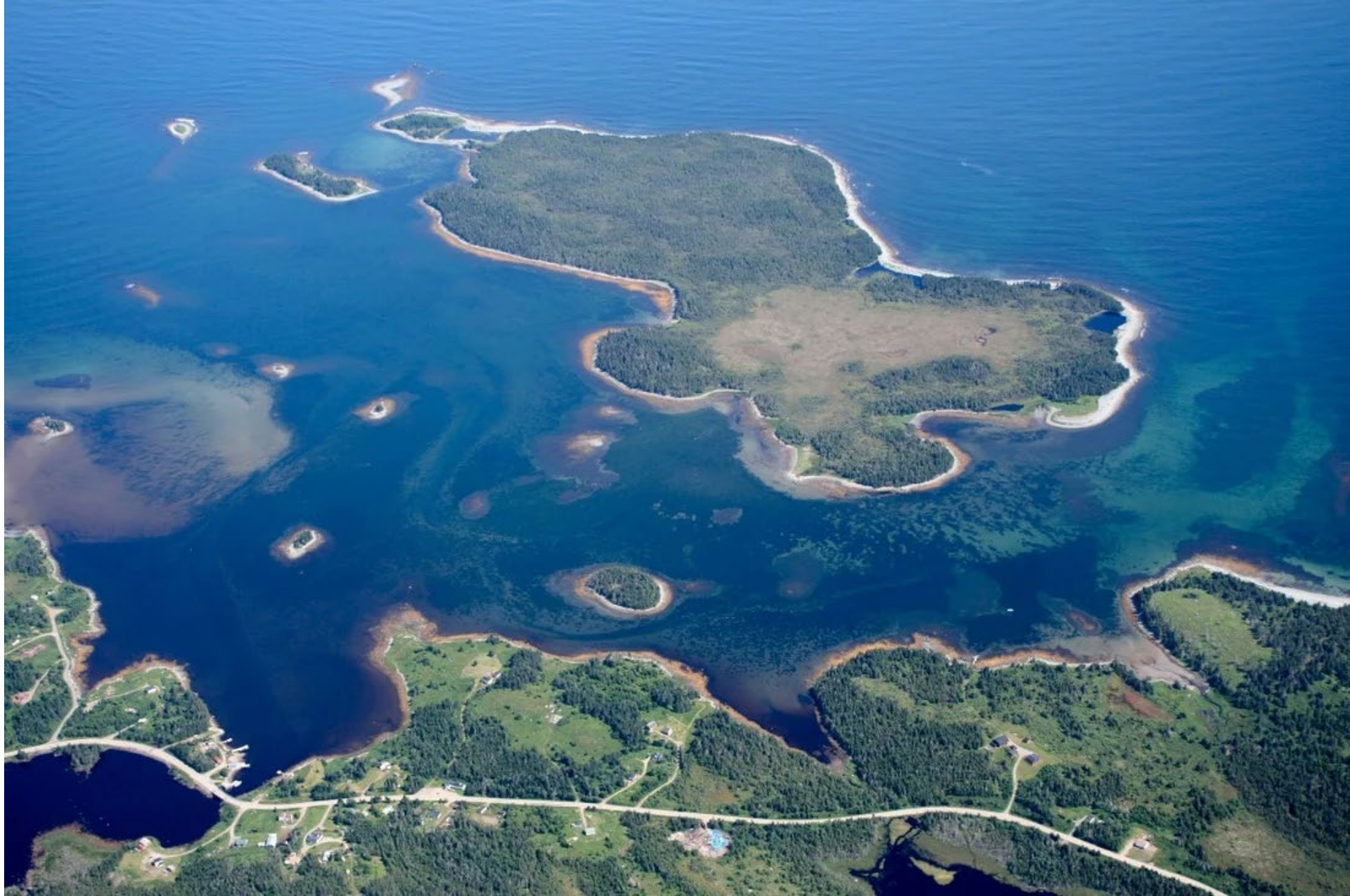
Coddle Island, Nova Scotia, is a 192-acre island near power and water access

https://img.i-scmp.com/cdn-cgi/image/fit=contain,width=1098,format=auto/sites/default/files/styles/1200x800/public/d8/images/methode/2019/11/19/e843c044-0a74-11ea-afcd-7b308be3ba45_image_hires_124609.jpg?itok=cQhAZfrd&v=1574138776