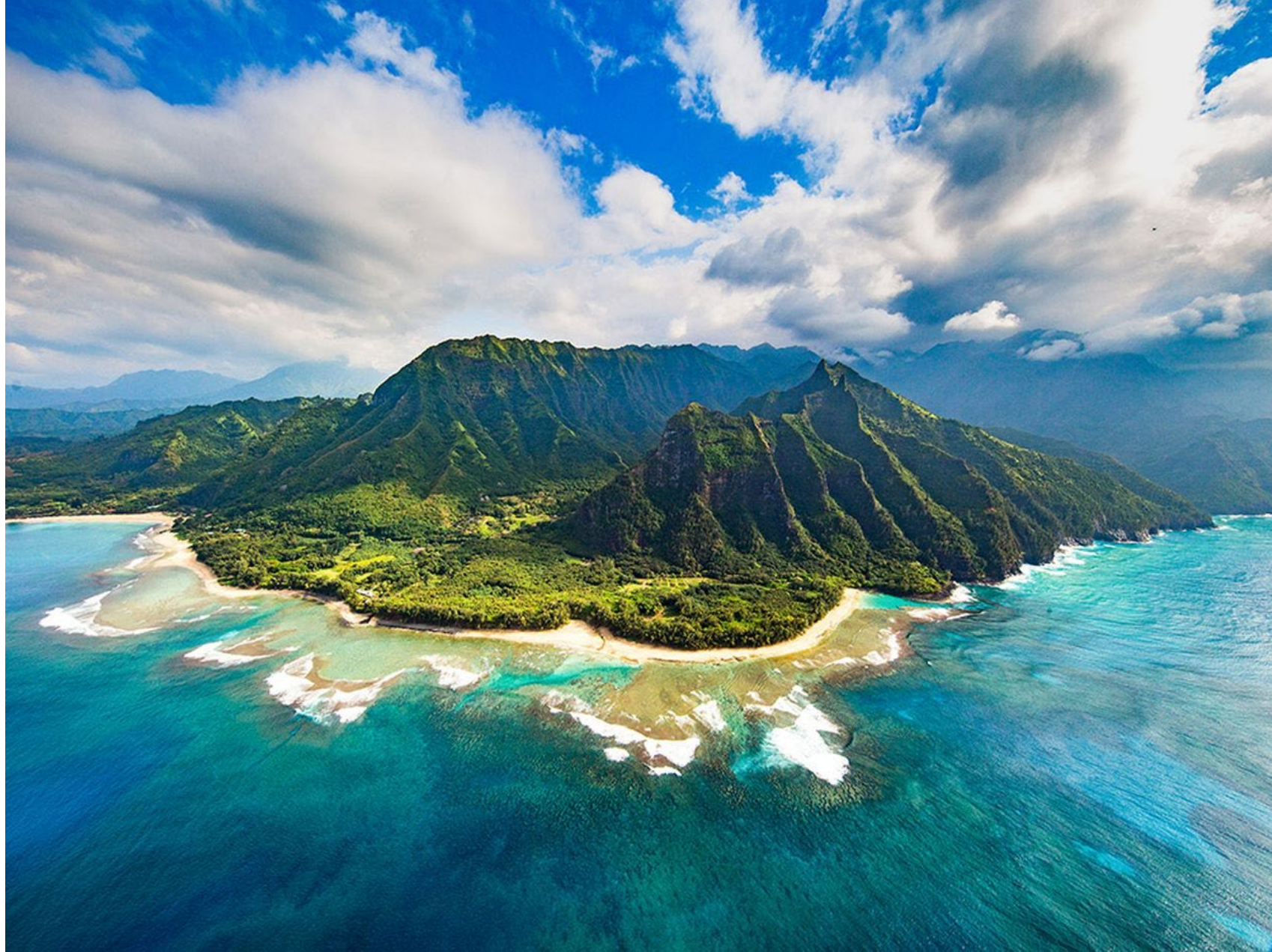
Kauai, Hawaii