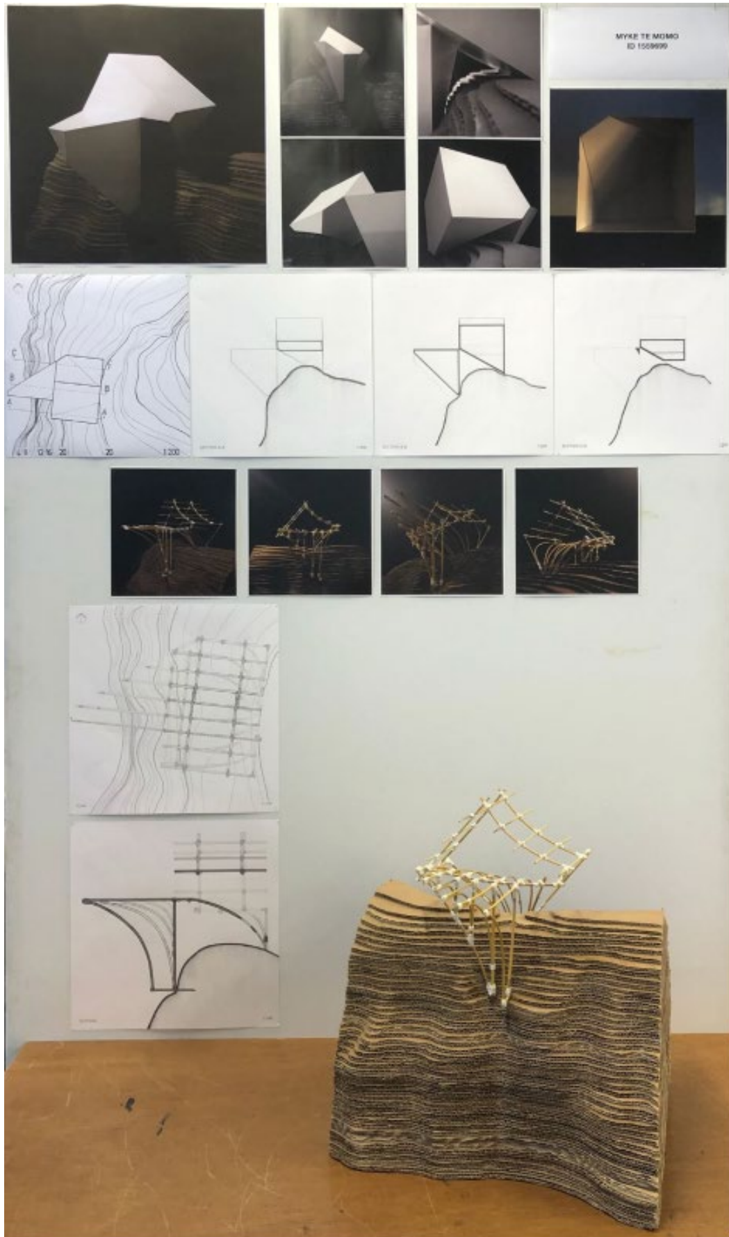
Student Exemplar (1): Final Presentation for SPACE + STRUCTURE