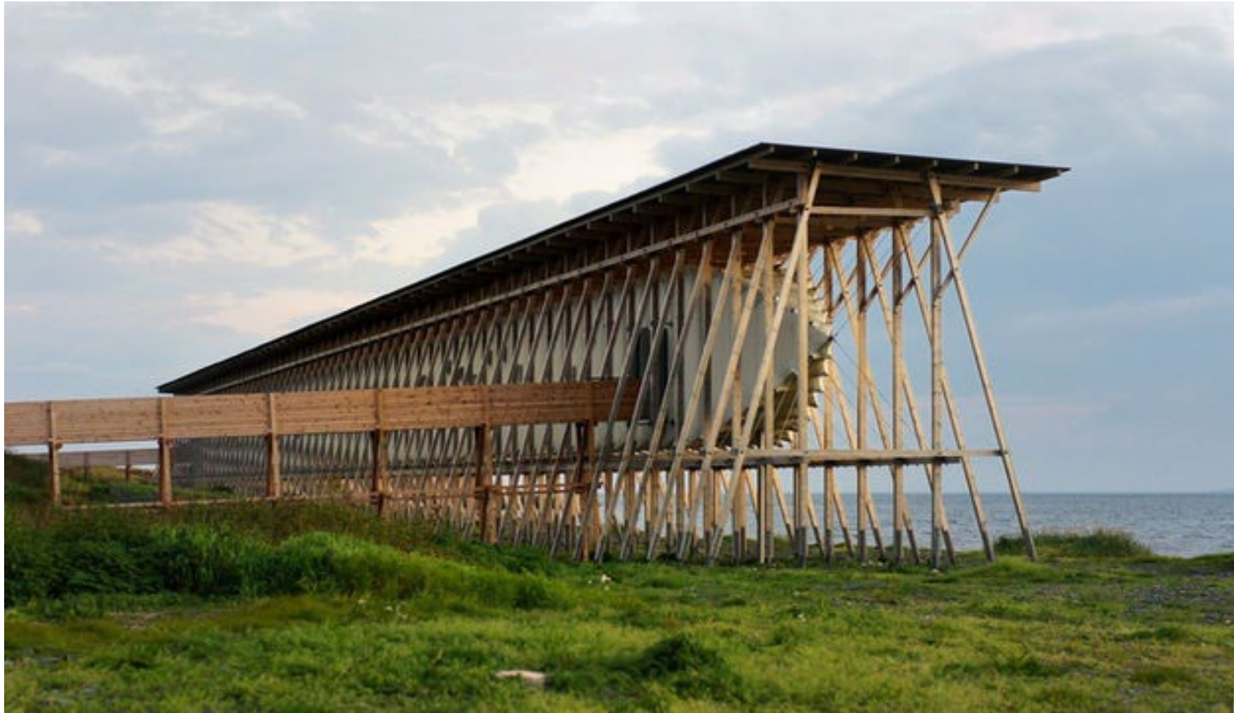
Peter Zumthor and Louise Bourgeois's Steilneset memorial to the victims of witch trials http://www.arch2o.com/steilneset-memorial-peter-zumthor-louise-bourgeois/