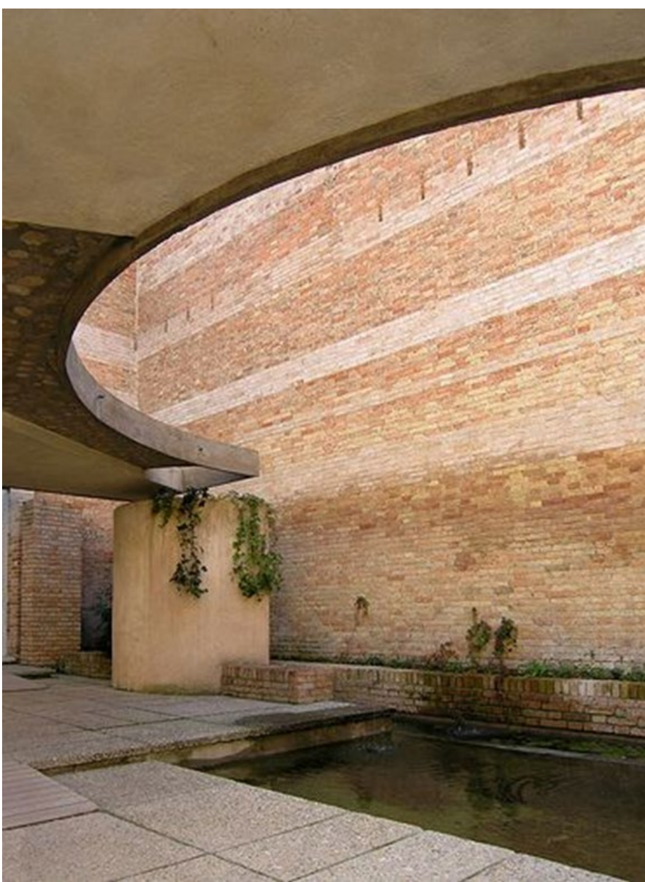
Covered courtyard for the exhibition of sculptures, central biennale pavilion, Venice 1950-1952.