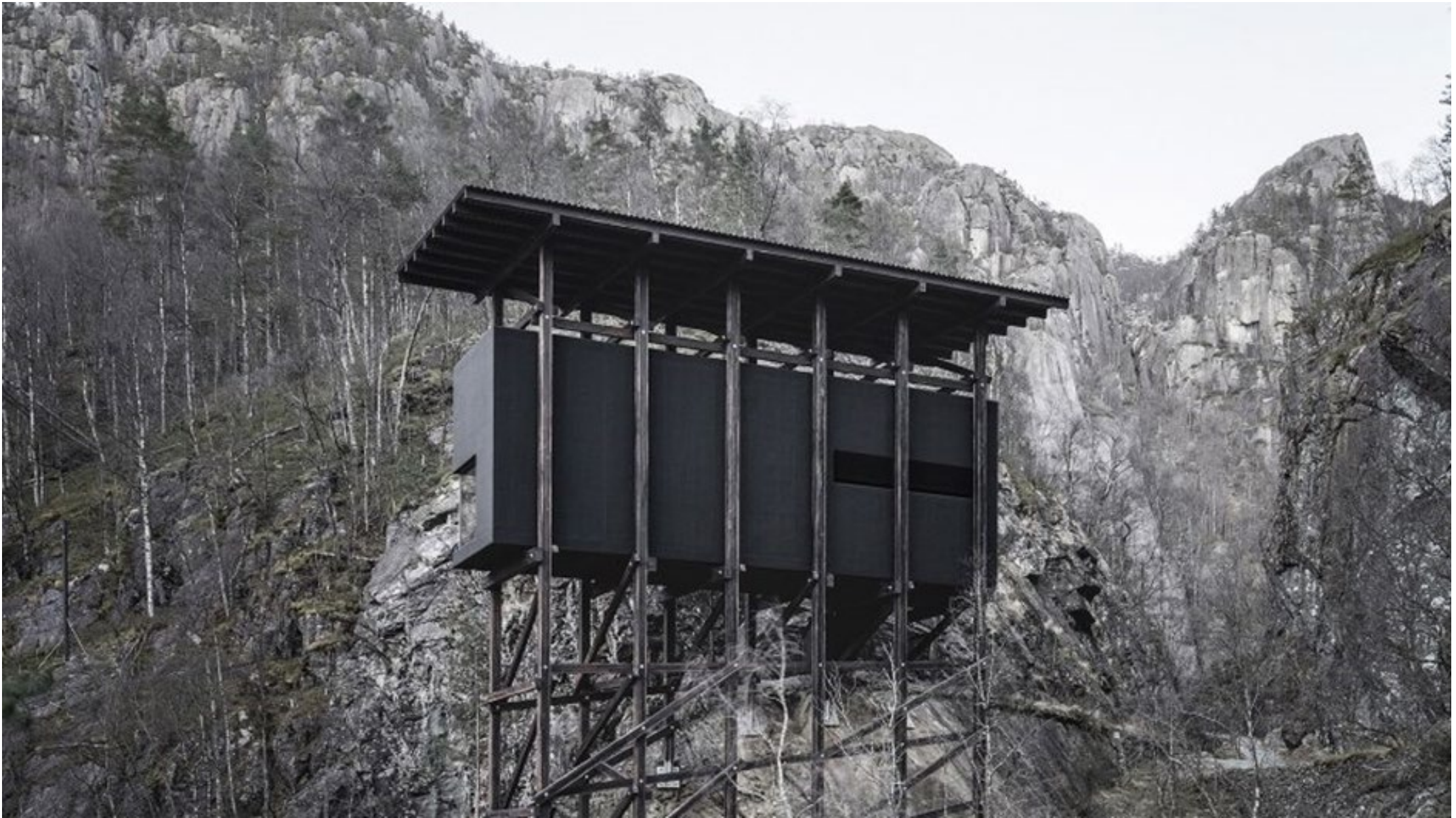
Peter Zumthor's stilted Zinc Mine Museum captured in photography by Aldo Amoretti