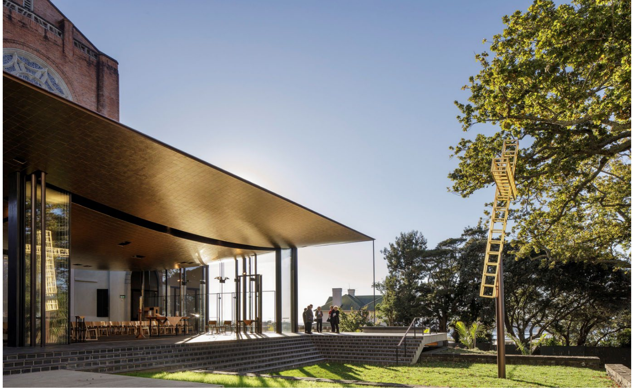
Fearon Hay Architects – Bishop Selwyn Chapel, Holy Trinity Cathedral, 2016