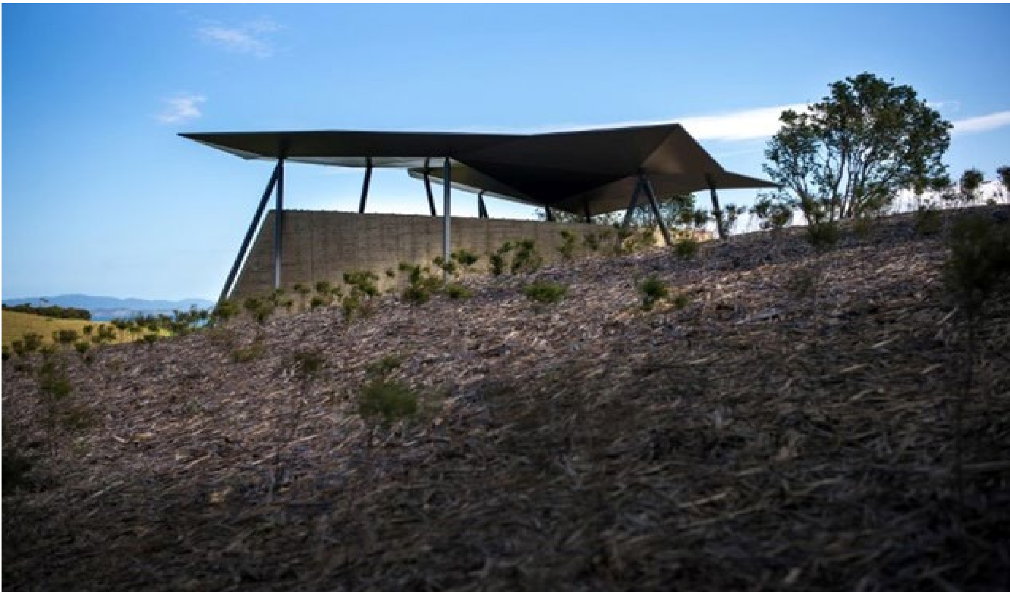
Finalist, Completed Buildings (Culture) and Small Projects: Rore Kahu - Marsden Cross Heritage Centre by Cheshire Architects.