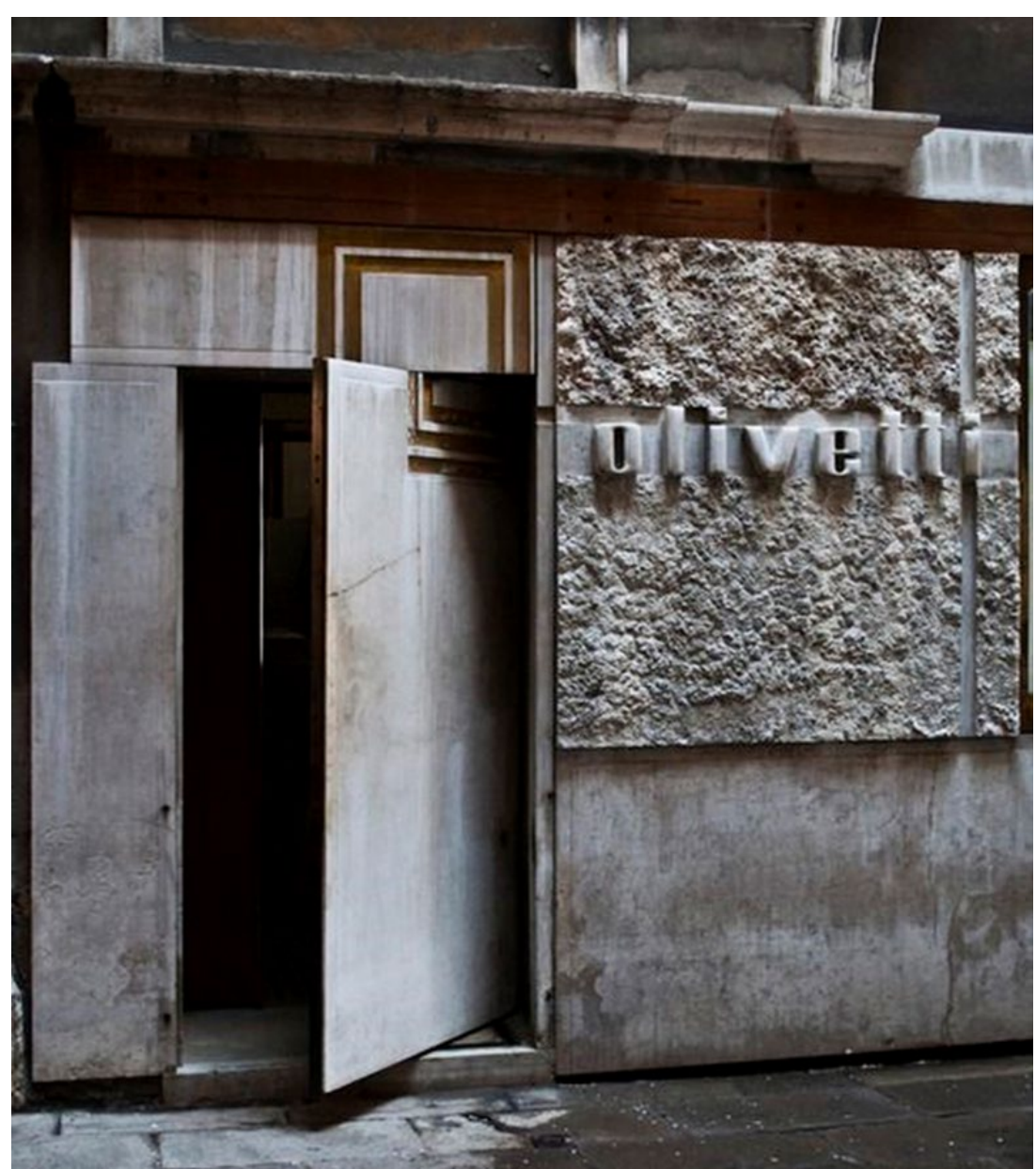
Olivetti Showroom - Carlo Scarpa - Venice – 1958

https://www.pinterest.nz/pin/78320480996556929/