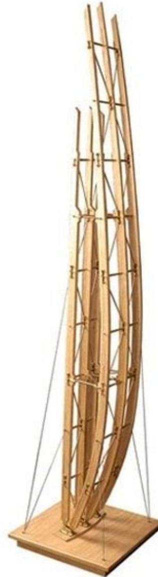
Sketch of the natural ventilation scheme, and model of the double facade system; images courtesy of Renzo Piano Building Workshop.

https://www.inexhibit.com/mymuseum/the-jean-marie-tjibaou-cultural-center-by-renzo-piano/