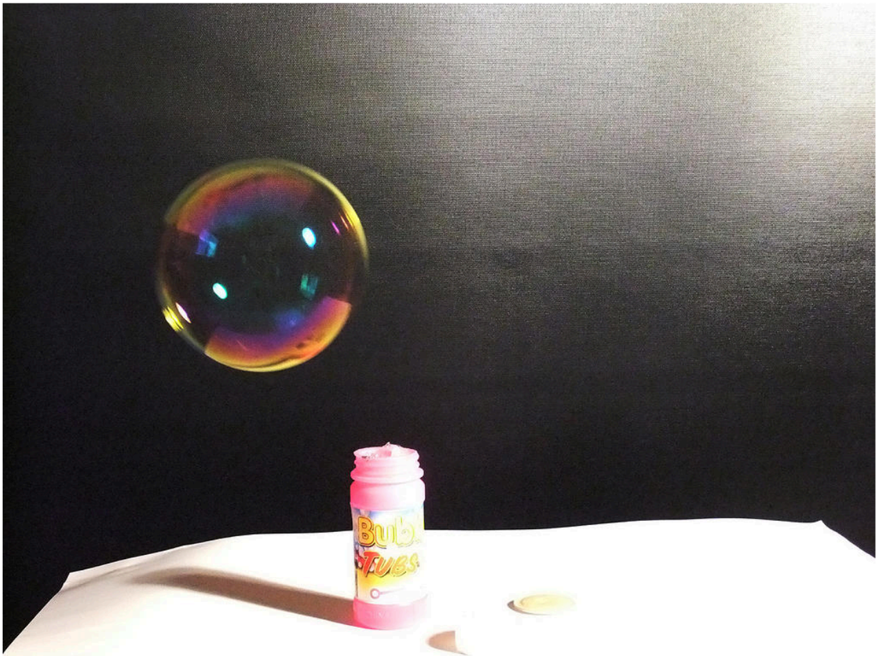
Bubbles are pretty, they have the colour of the rainbow and they are free.

© Tracy Kumari 2011 / Chapter 1 / PhotoVoice