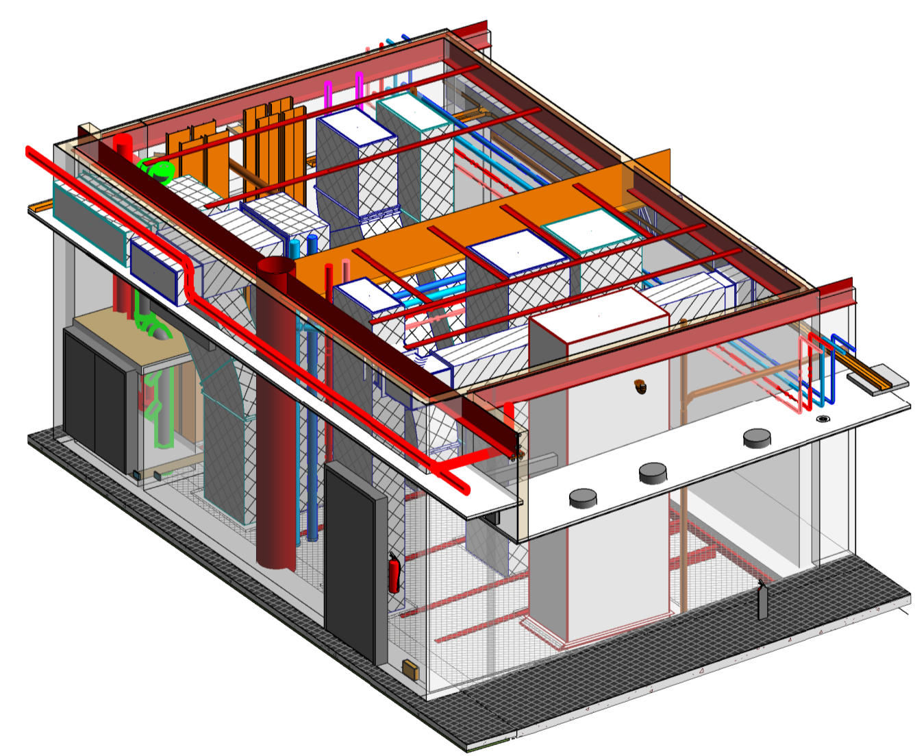
SERVICES RISER LEVEL 1 VIEW - NORTH TO SOUTH